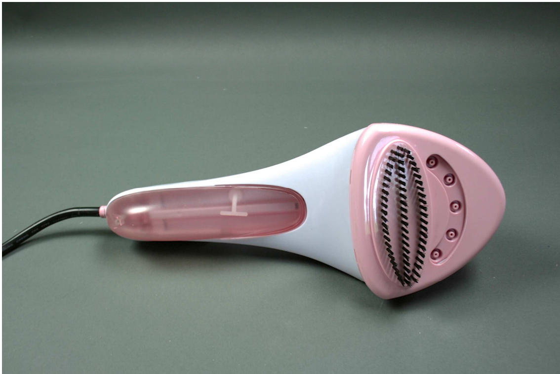
Attached steam iron brush.