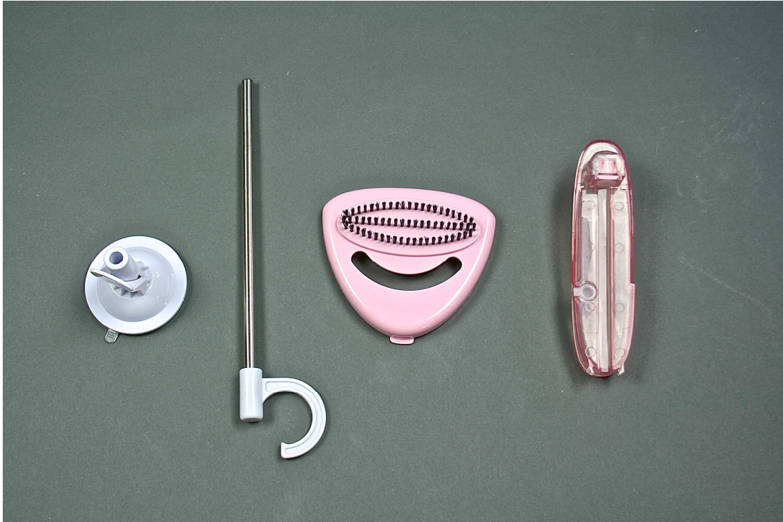
Steam ironing accessories. Cloth hanger, brush for tougher fabrics (snap on), smaller water tank for steam ironing.