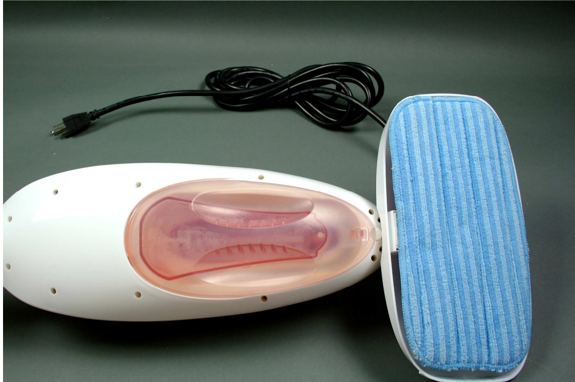
Back of mop with water tank.