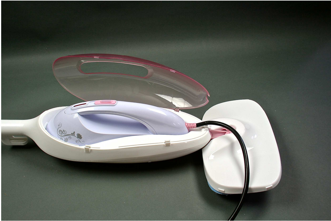
Mop with steamer.