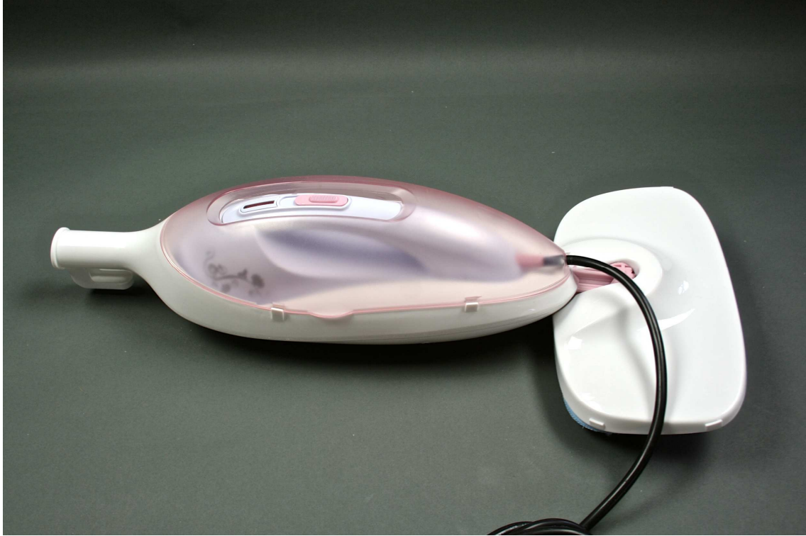
Closed pink lid.